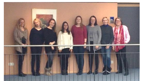
Second meeting in Cham

Co-funded by the Erasmus+ Programme of the European Union