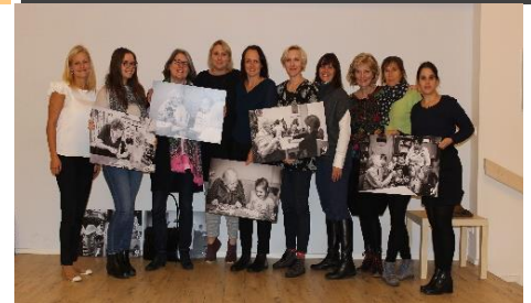
Kick-off meeting in Prague