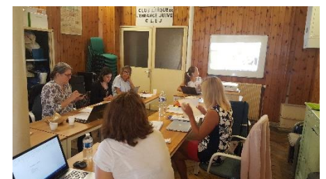
Third meeting in Paris

Co-funded by the Erasmus+ Programme of the European Union