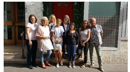
Third meeting in Paris

Within the next months, project partners will focus on finalizing the Activity register structure and testing the software before making it publicly available.