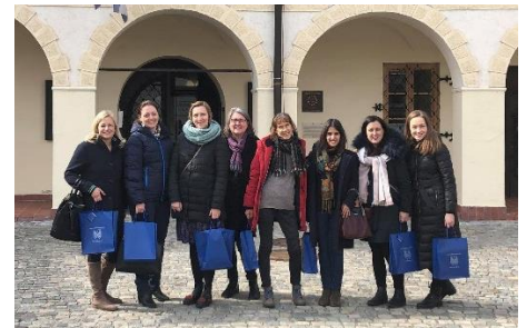
Project meeting in Slovenj Gradec

The activity register is taking shape and is being translated into all languages of the participating partners. The partners also exchanged feedback from the trainers participating at the seminar in Prague. The participants were very positive about the seminar and engaged throughout. They received valuable information and tips on how to work with intergenerational groups and also how to transfer this knowledge to the volunteers at the pilot testing in their countries.