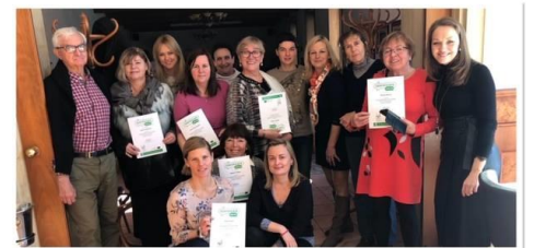
Train the Trainer Seminar (Prague)

Co-funded by the Erasmus+ Programme of the European Union